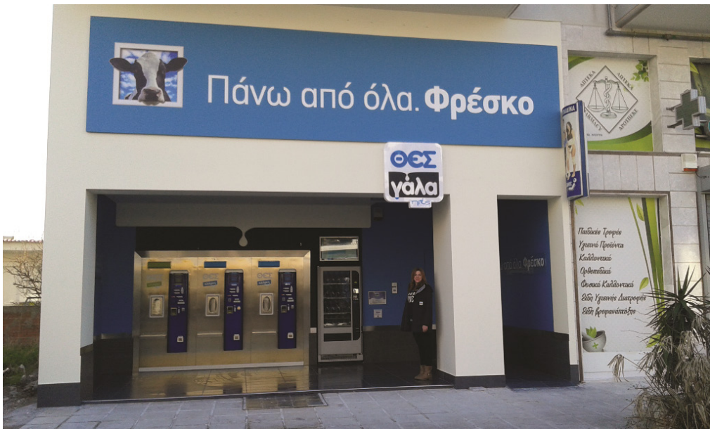
Picture 1: A station of fresh milk vending machines of “THESS GALA PIES”,

Picture 1 shows a “station” of the way milk is distributed by the company “THESS GALA PIES”, through vending machines that sell fresh milk being poured into bottles (glass or plastic) for the customers.